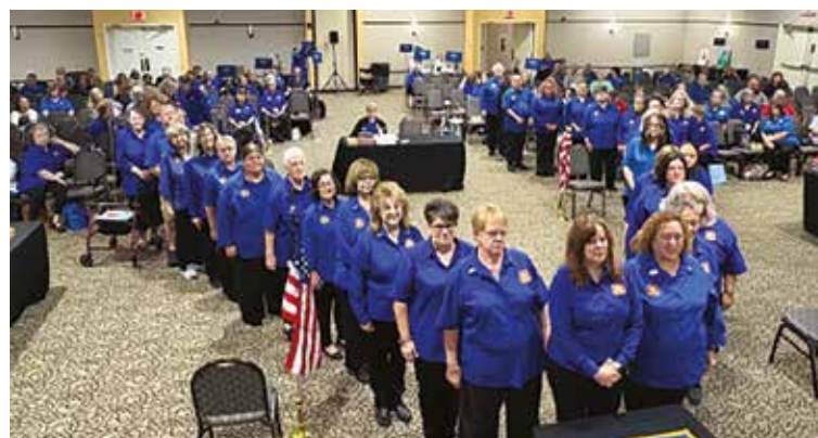
Installation of 2025-26 Auxiliary Officers.