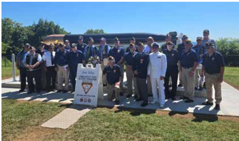
Post 7293 is in Whitehall Township, perched on a hill that commands a heart-stirring view of the Lehigh Valley. The restored torpedo — set on two stone bases atop a concrete pad — gives a briny flavor of naval history to the manicured grounds, which until now were dominated by the aviator aesthetics of an F-14 fighter jet.

VFW Post 3945 Welcomes All Hospitalized Vets