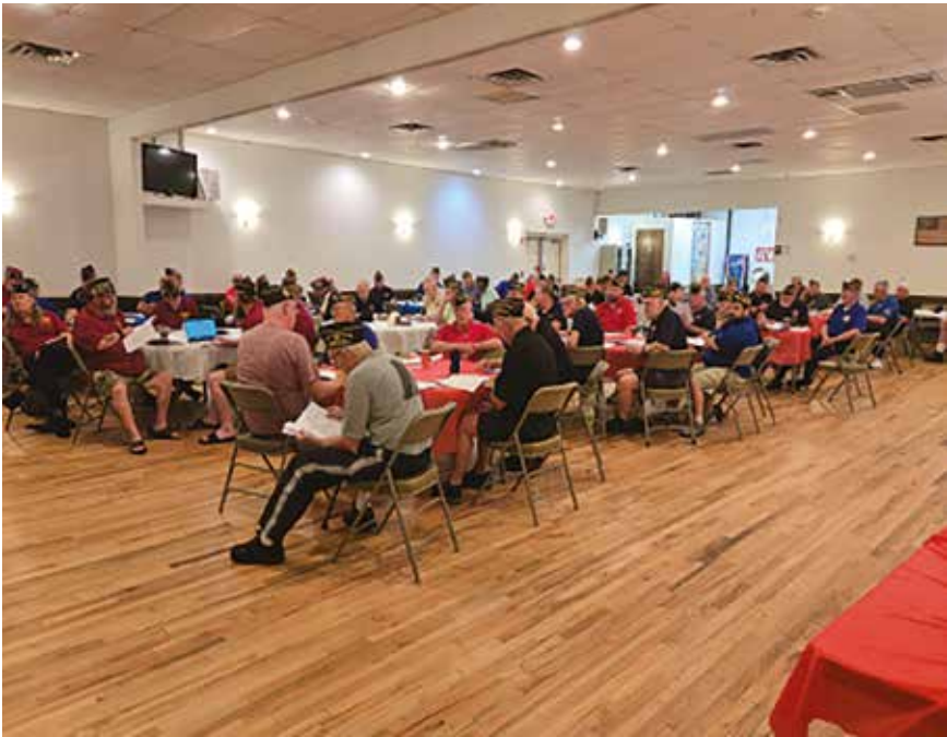
OTI Training 2025-2026