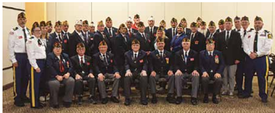
2025-2026 Leadership COA Team