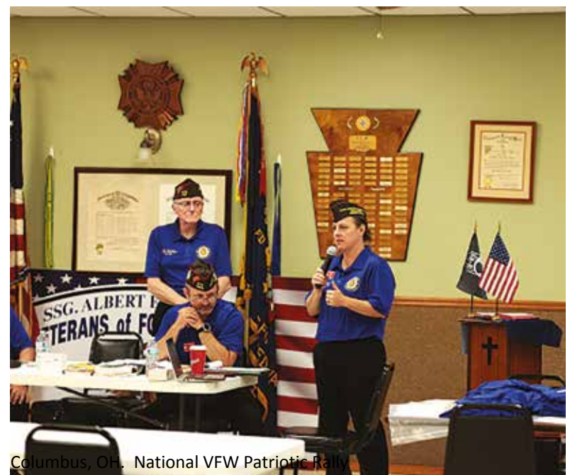
Columbus, OH. National VFW Patriotic Rally

As the VFW looks toward the future, ongoing training and collaboration will remain essential in fulfilling its commitment to veterans, service members, and their families.