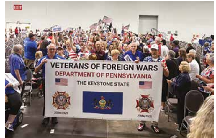
Columbus, OH. National VFW Patriotic Rally.