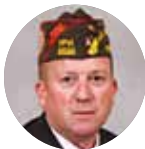
FRANK MCGOVERN STATE JUDGE ADVOCATE

PASS THROUGH PROCESS FOR VFW POSTS to receive DONATIONS from outside organizations/individuals that are required to donate to a 501(c)(3) corporation if your Post is incorporated as a 501(c)(4) corporation.