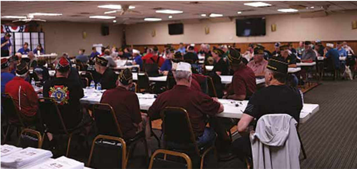
OTI Training 2025-2026