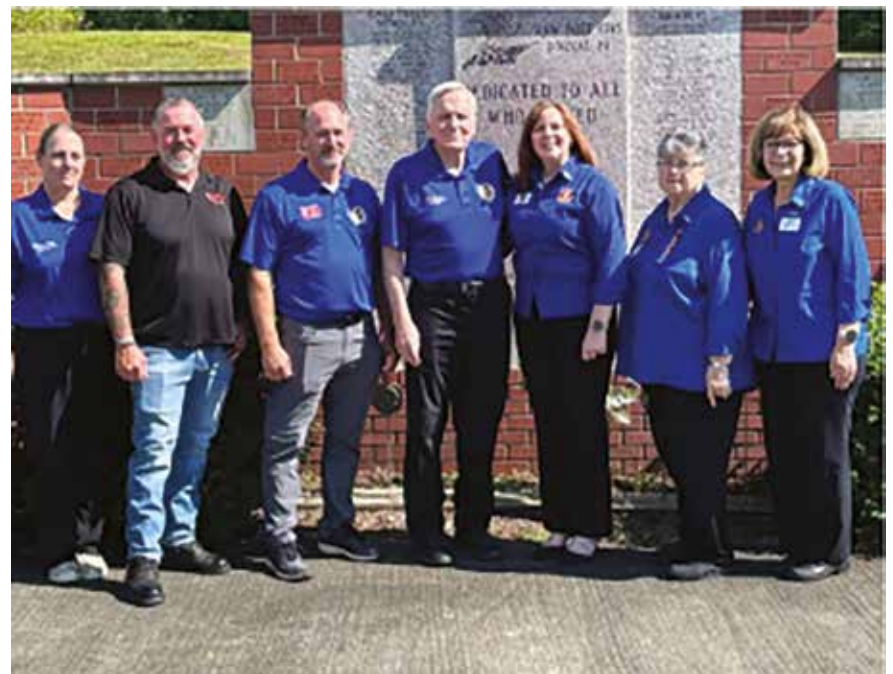
District 27 Meeting