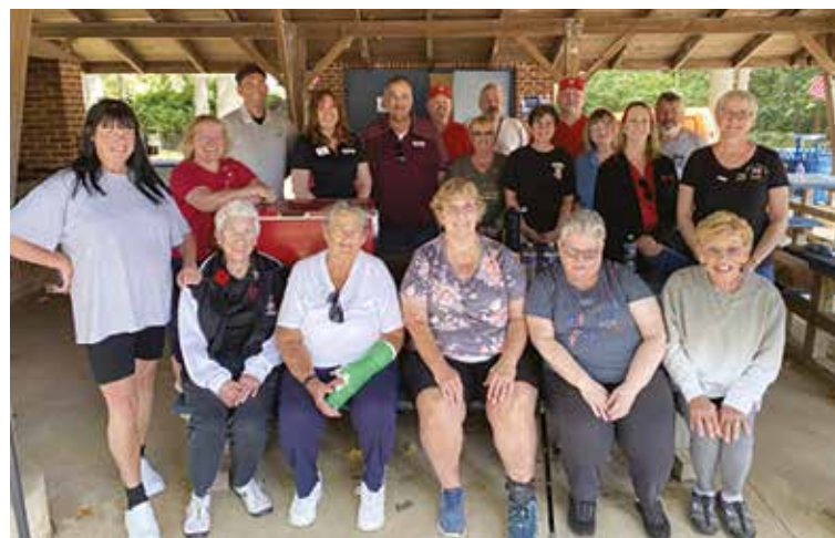
Labor Day Picnic at Coatesville VA Medical Center, an annual picnic hosted by the Comrades, Brothers and Sisters of District 9.