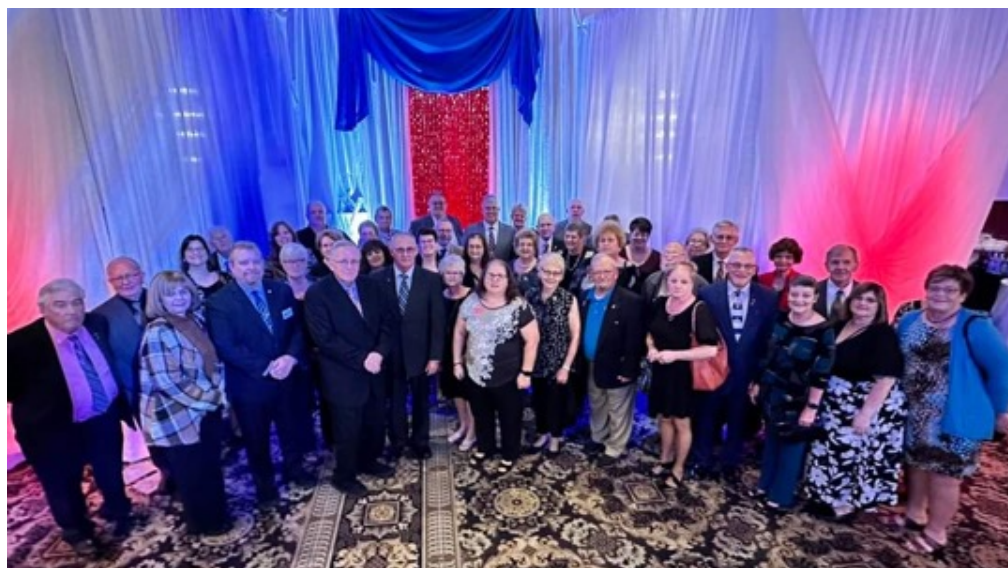
Department of PA Leadership Team at the Eastern States Conference in Atlantic City, New Jersey October 20-21, 2023.