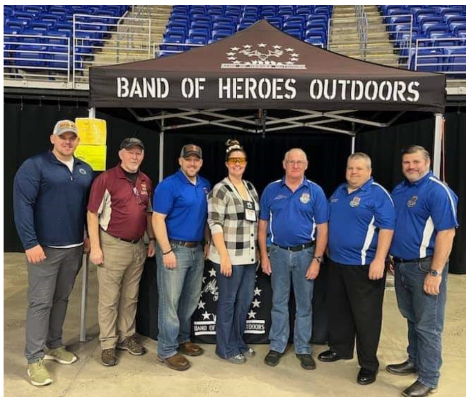
PA VFW Membership Team recruiting event in State College, PA.