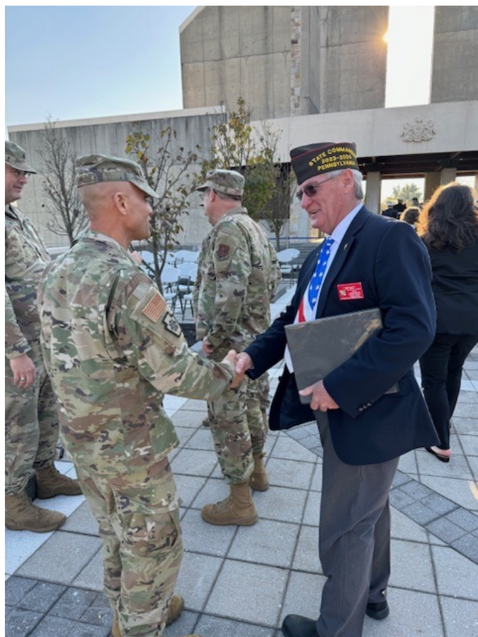
Ft. Indiantown Gap National Cemetery Veterans Day Program.