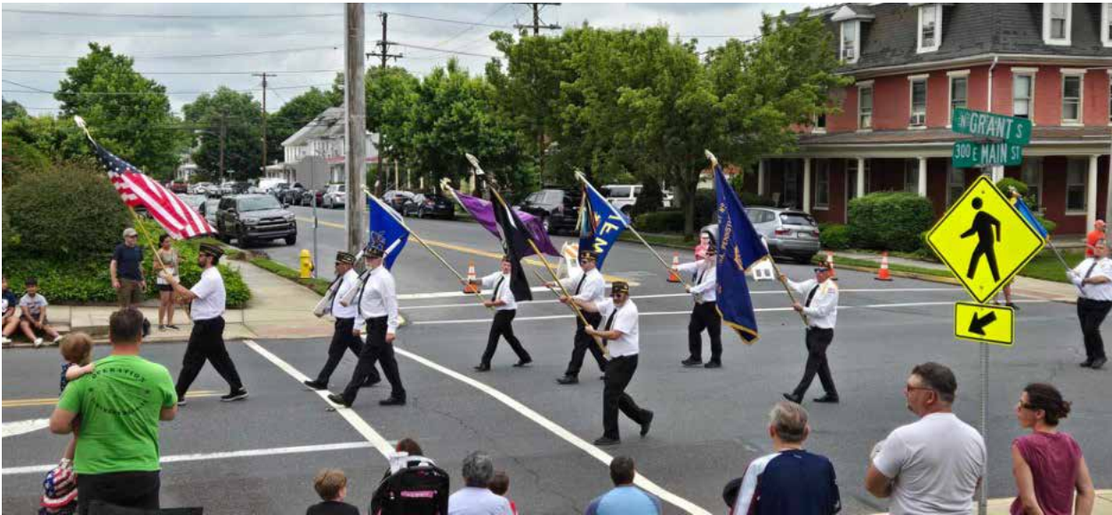
Palmyra VFW Post 6417 and Auxiliary Memorial Day Parade