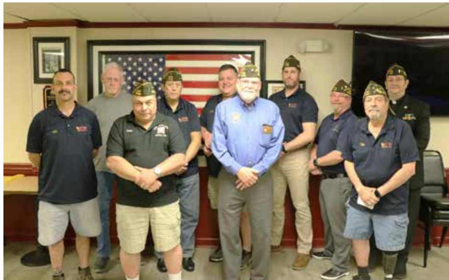
The installation of Officers of the Media VFW Post 3460