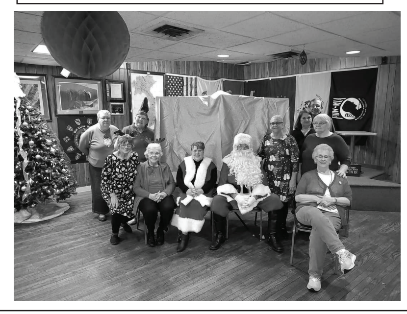
West York Post 8951 and their Auxiliary hosting the children's Christmas party. Thank you all for your continued service and dedication to your community.