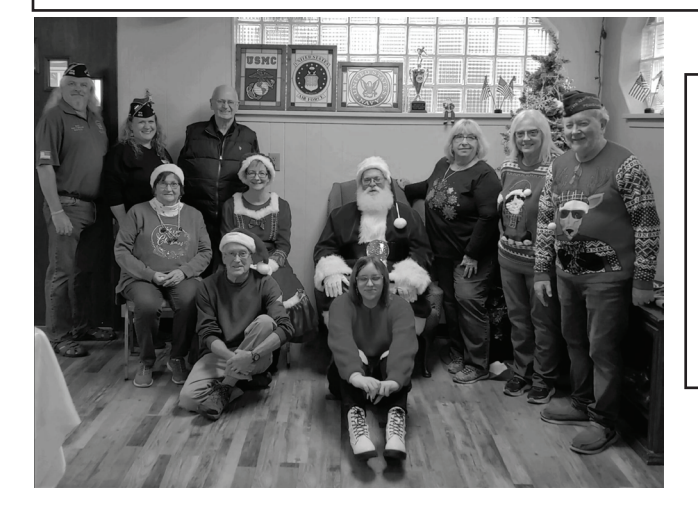
Cocalico Valley VFW Post 3376 had their Christmas visit with Santa. Special thanks to the VFW and Auxiliary members who made the event happen.