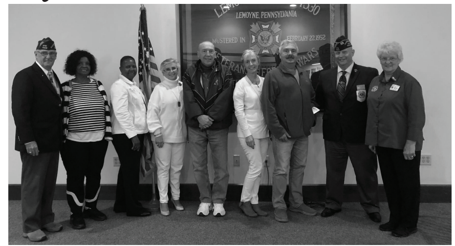
Lower Allen TWP VFW Post 7530 host Gold Star family members from central Pa. In attendance: