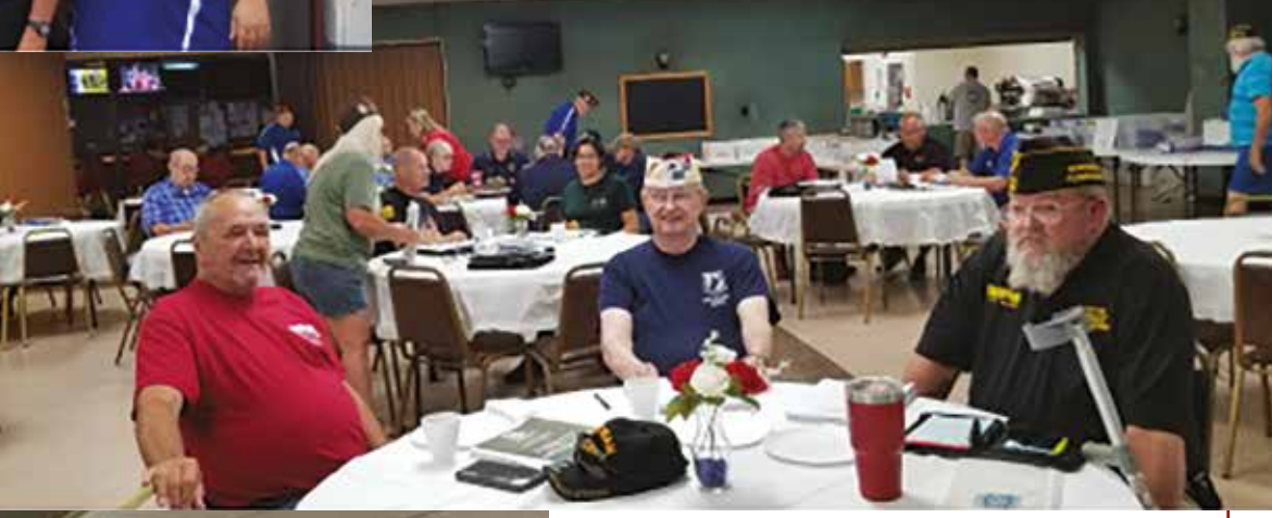
VFW POST 5754