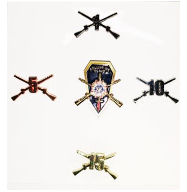
Commander-in-Chief Pin and Recruiting Pins