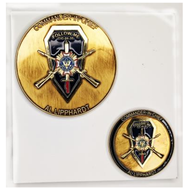
Commander-in-Chief Medallion and Coin

Below you will see examples of some of the awards and items mentioned in this program. For more information, contact the VFW Membership Department.