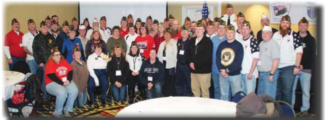
Left photo: A strong contingent of female VFW members participated in the Mid-Winter Conference including these 17 women veterans; conference workshops featured four of them as presenters. Right photo: Conference participants included an impressive number of veterans who earned their VFW eligibility during military action beginning with Operations Desert Shield/Storm and running through the nation's newest campaign medals.