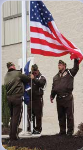
(Left and above) New Bloomfield Post 7463 provided a Color Guard unit for the dedication of a new flag pole at the Central PA Food Bank. The Post participates in the Food Bank's Military Share Program.