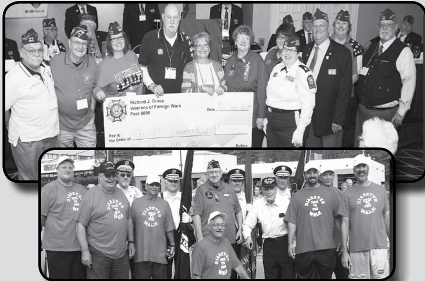
The Department's long-standing support for diabetes research and patient services continued in 2017 with a 100-mile Erie to Pittsburgh trek and a 40-mile event walk by District 21 Posts. Combined, $35,000 was added to the $2.1 million total dating back 40 years to the first western PA March for Diabetes event. The top photo shows participants and supporters of the District 21 march, which raised $20,000, in part due to a $5,500 donation from Etters Post 537 and Auxiliary. The bottom picture shows the Erie to Pittsburgh team with Post 2754 Color Guard members. Twenty-five percent of veterans live with disabilities and symptoms of diabetes. Posts are asked to make donations to this fundraiser with checks sent to State HQ earmarked "Diabetes Walk".