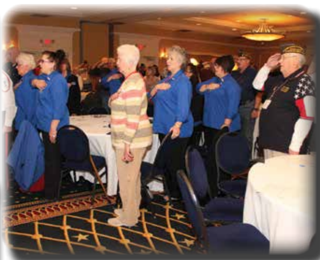
VFW and Auxiliary members participate in the Mid-Winter Conference opening ceremony at the Wyndham Hotel in Gettysburg. Historically, a joint session of both groups is held before the Department Auxiliary begins its own conference activities.