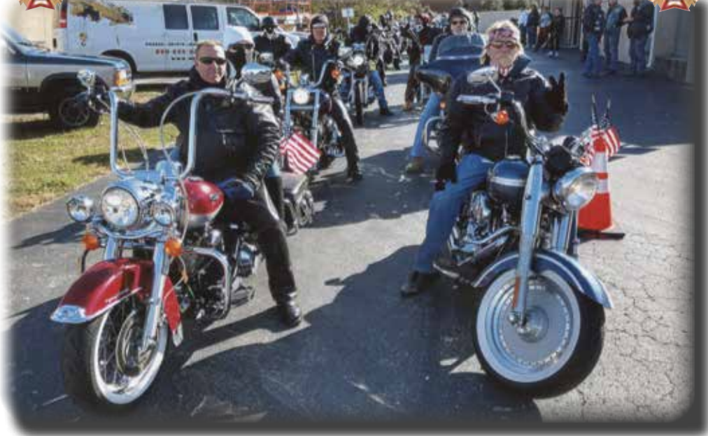
King of Prussia Post 7878 held a Veteran's Day Salute Ride during which 37 riders endured 20-degree temperatures to honor veterans from all service eras.