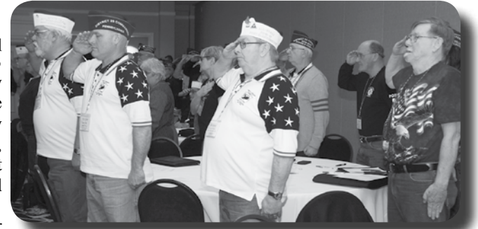
Three hundred Department, district and post leaders from across the state participated in the conference.