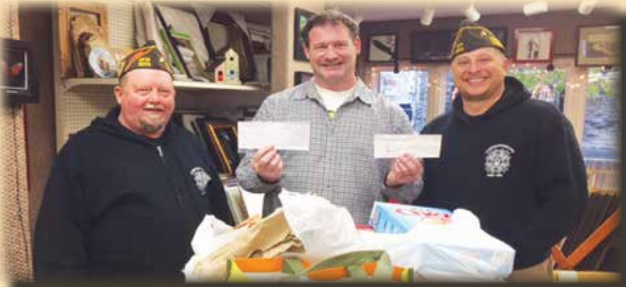
On Veterans Day, Conshohocken Post 1074 raised $350 for the Colonial Neighborhood Council and matched it with another $350. In addition to raising money to help those in need, the post also collected food to support a local food pantry.