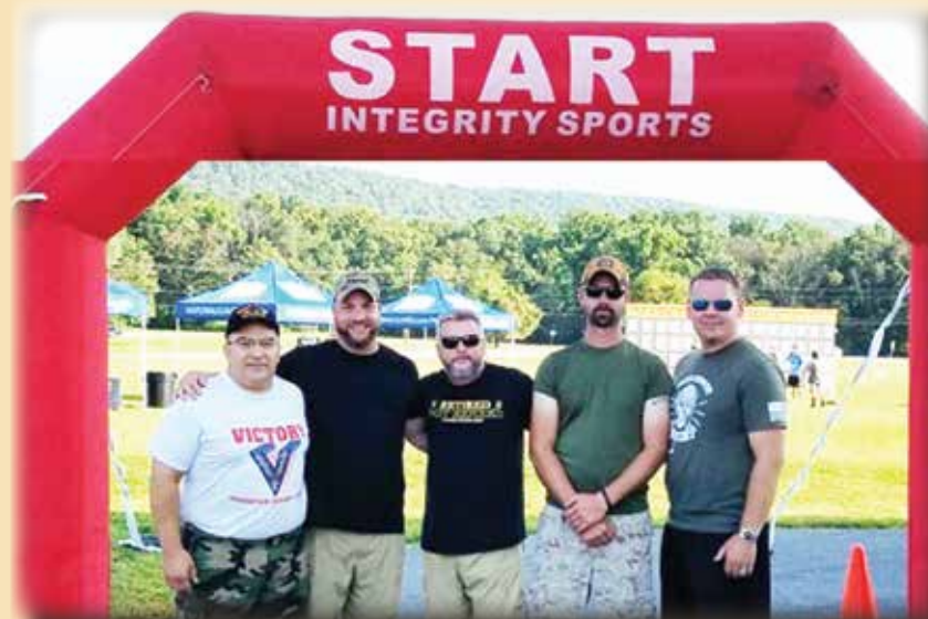
New Freedom Post 7012 participated in the “March for the Fallen” at Fort Indiantown Gap, Anville. Shown are the post officers prior to the start of the event. The march is held to honor members of the Pennsylvania National Guard who were killed in action during the War on Terror.