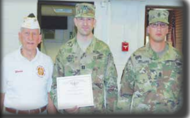
Chalfont Post 3258 is very active in the local community. Members place flags in area cemeteries on veterans' graves, sponsor patriotic student essay contests, share their military experiences with students, hold flag retirement ceremonies, visit retirement communities, and support military activities.

Folsom Post 928 and Auxiliary participate in many community service programs, including local Memorial Day recognition activities.