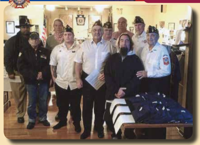
King of Prussia Post 7878 members gather for a photo during a break in activities that were held during the Veterans Day weekend.