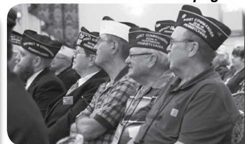
Post officials watch the nomination of officers.