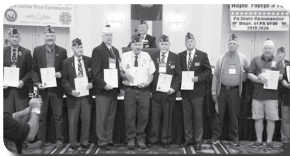
Many posts received certificates of recognition for their strong support of the VFW's National Military and Veterans Service program, which provides emergency financial assistance to veterans and military families.