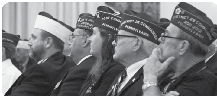
Delegates closely follow reports given by program chairpersons.