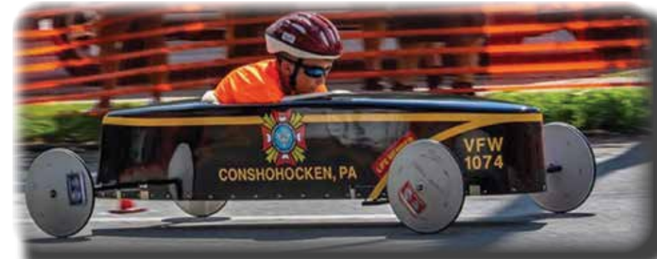
Conshohocken Post 1074 sponsored a car in a local soap box derby competition, which garnered the Post positive community exposure. Supporting the soap box race event is just one of the ways that Post 1074 is reaching into the community to show veterans and the public that the Post is more than just a social organization.