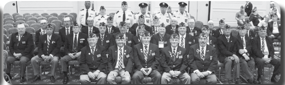
Pictured after the Installation of Officers at the State Convention are members of the Department's Council of Administration (left) consisting of Line Officers and District Commanders; and State Sergeants-at-Arms, Membership Recruiters and Program Chairpersons (right).