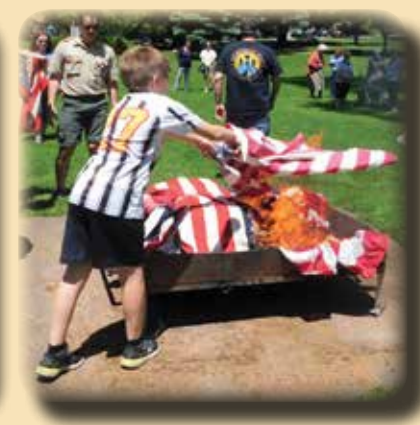
Leetsdale Post 3372 holds a flag retirement ceremony with the help of Boy Scout Troop 243 and the Sewickley community. The ceremony was held in conjunction with a Memorial Service. Three youth played taps from locations around a war memorial. Participants help place the flags into the fire.