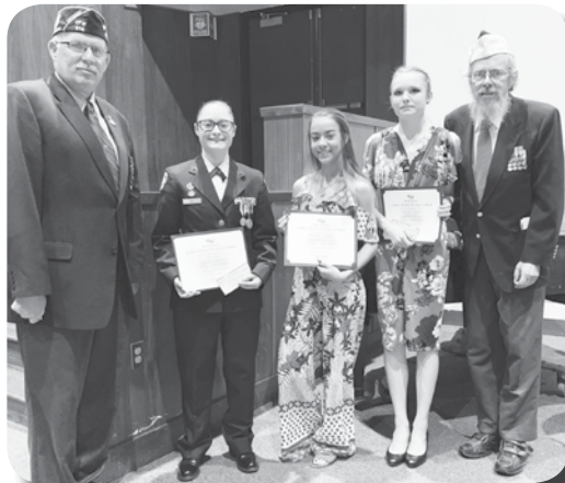
Activities like this project, featuring West Mifflin Post 914 Intrepid officials presenting scholarships to local high school students, help VFW posts to demonstrate their positive impact on communities.