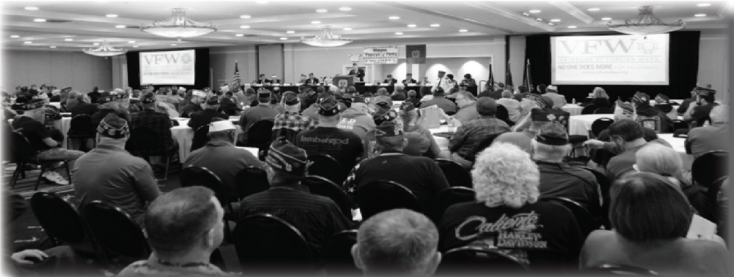
VFW members from across the state pay close attention to information being provided during the daily sessions at the Mid-Winter Conference in Gettysburg, Pennsylvania.

Among the other ways that the VFW Department of PA supports military personnel is through continued financial and moral support of those returning from war with physical and emotional injuries. PA Wounded