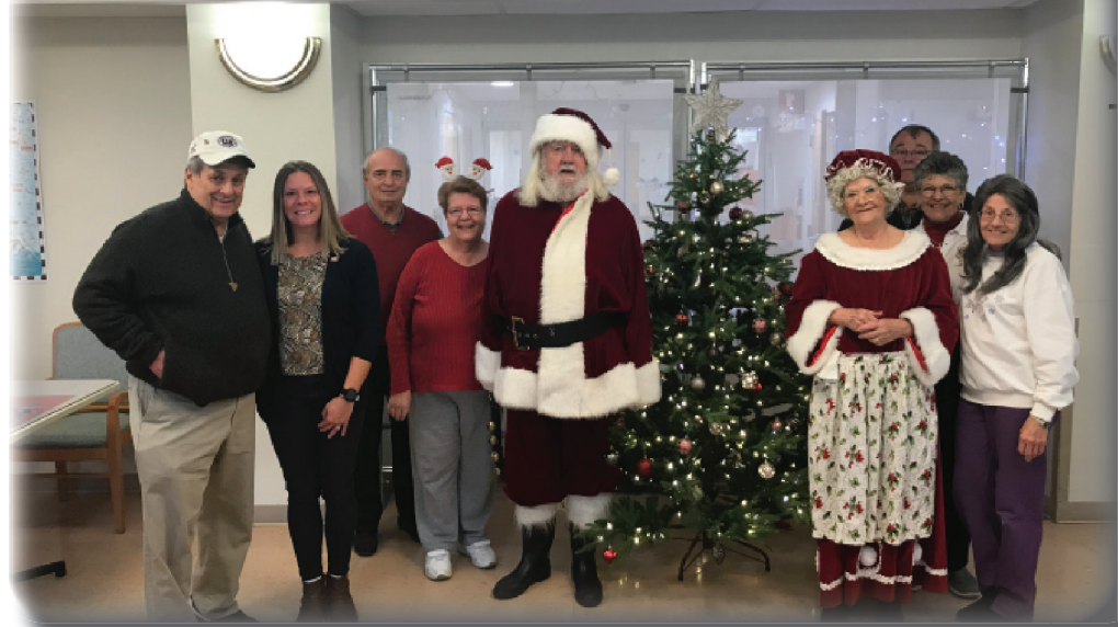
Post 7530 VFW and Auxiliary Volunteer Warriors made their quarterly visit to the Lebanon VA Hospital. The post members went out and made a difference in bringing some cheer and comradeship to our fellow Veterans. Special thanks to VFW Santa and Mrs. Claus for donning their Christmas outfits to make the extra difference!