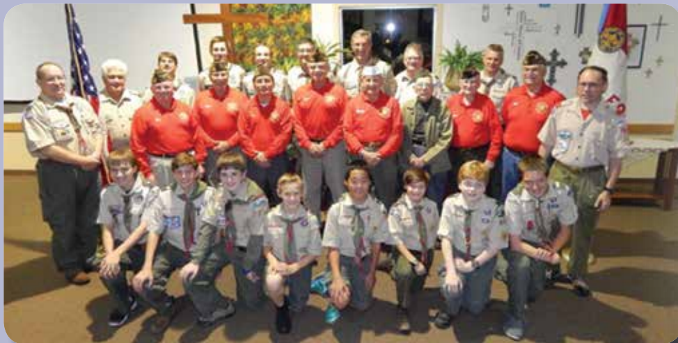
Chalfont Post 3258 members are shown with BSA Scouts and leaders of Troop 133 on Veterans Day. The post was invited to visit with the Scouts to share military service stories and answer questions. Everyone enjoyed an indepth discussion about patriotism, citizenship and the concept of giving back to the community through military service.