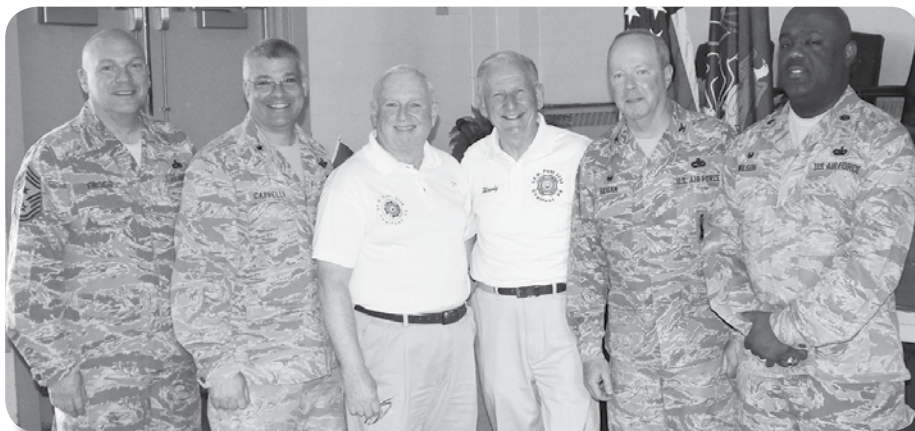
Chalfont Post 3258 has a strong reputation as a service organization, in part, through its outstanding military appreciation efforts.

Posts should appoint a community activity reporting coordinator who collects photos, newspaper clippings, thank-you notes and other items that can be used to create a record book.