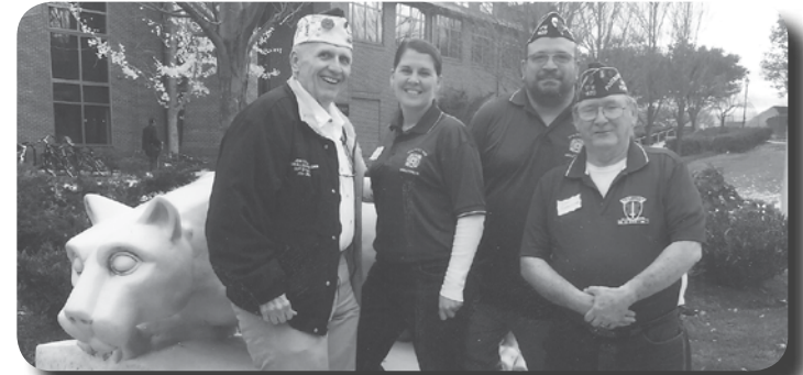
Middletown Post 1620 participates in numerous community and veteran-related events including a Veterans Day program at the Harrisburg campus of Penn State, a homeless veteran Stand Down in Harrisburg, a community blood drive and sponsoring sports teams.