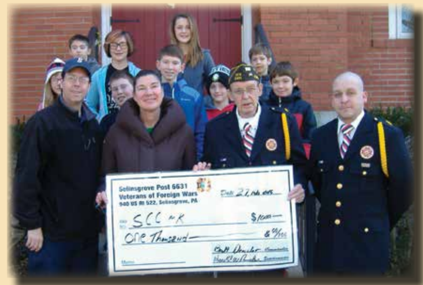
Selinsgrove Post 6631's proudly made a $1,000 donation to the Snyder County Collation for Kids, an organization that promotes youth development.

DUE TO THE MANY PHOTOS RECEIVED SOME PICTURES ARE BEING HELD FOR THE NEXT ISSUE. VFW NEWS CANNOT REPRODUCE NEWSPAPER CLIPPINGS. PLEASE ASK YOUR LOCAL PAPER FOR PERMISSION TO REPRINT A PHOTO AND EMAIL THE FILE TO DSANDMAN@VFWPAHQ.ORG. PHOTO PRINTS ARE ALSO ACCEPTED VIA EMAIL OR REGULAR MAIL.