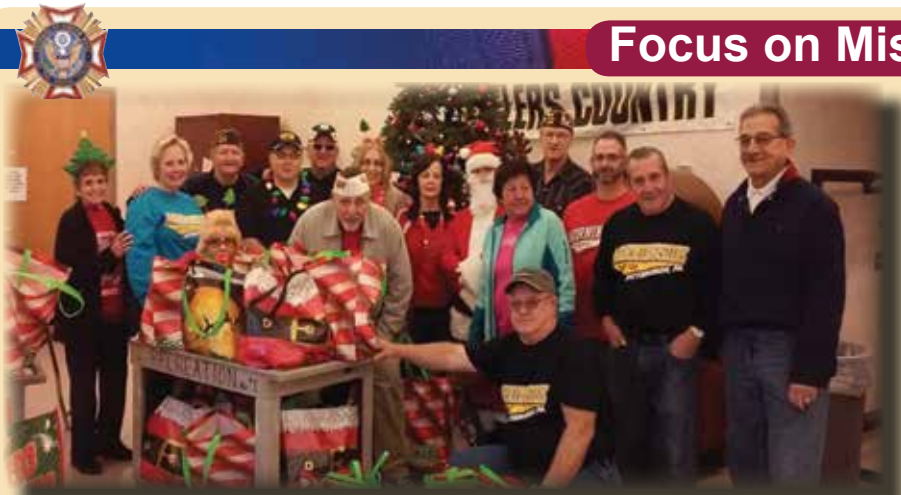
Morningside Post 3945 held its Holiday Visit for Hospitalized Veterans during which members handed out Christmas gifts to 54 hospitalized veterans at H.J. Heinz Division of the VA Pittsburgh Healthcare System. The VFW volunteers visited with veterans to spread good wishes and holiday cheer. Each hospitalized veteran received a gift bag loaded with clothes, toiletries and games.