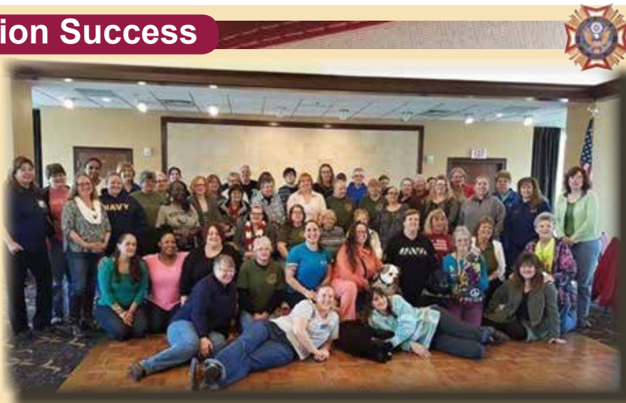
Female veterans take a break from activities at the Department's Women Veterans Retreat in the Poconos. Thanks to a strong number of donations the ladies enjoyed an all-expense-paid weekend complete with fun, information and recreational activities.