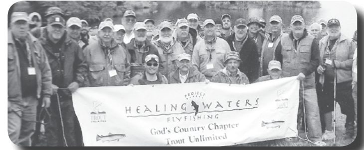
Greensburg Post 33's many community service projects included supporting a fishing outing held by "Healing Waters Fly Fishing." The event gave 30 hospitalized veterans a chance to enjoy the outdoors.