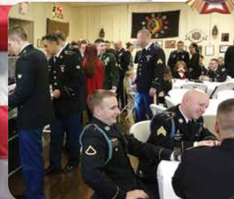
PAARNG soldiers enjoy the annual Support the Troops Holiday Party hosted by Huntingdon Post 1754. All posts are encouraged to create relationships with their closest military unit as part of fulfilling the VFW's mission of serving others.