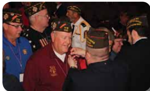
Vietnam veterans received a Vietnam War 50th Anniversary pin during a special ceremony.