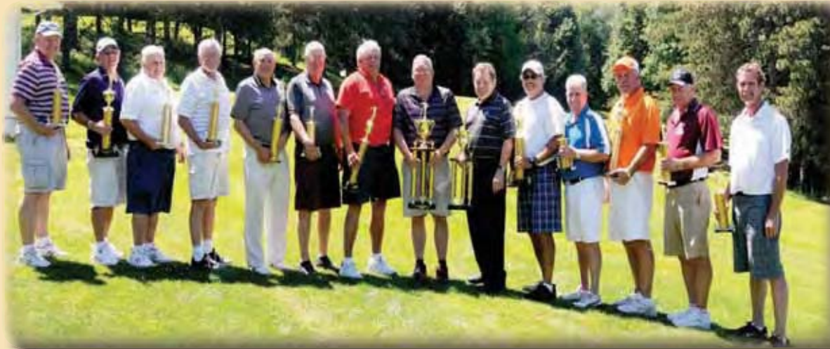
Winners of the Department's Annual Golf Tournament stand proudly with their trophies. Indiana Post 1989 is the long-time sponsor of the tournament, which brings together golfers from across the state. Congratulations to the winners and to Post 1989 for operating a well-organized, enjoyable event for golfers of all ages.