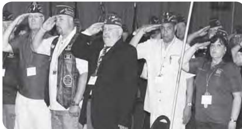
Post delegates salute the United States flag at the start of a daily session.