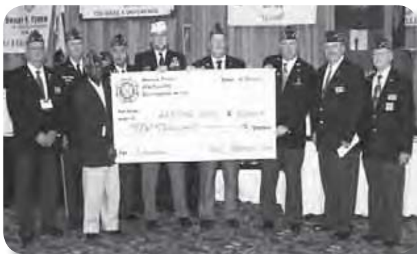
Downingtown Post 845 presented numerous donations during the Convention including $10,000 to the VFW's National Home in Michigan.