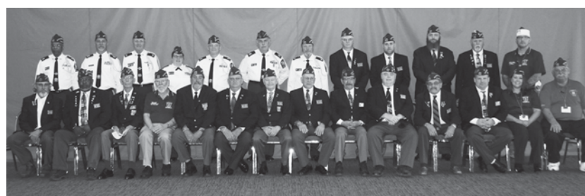
Pictured after the Installation of Officers at the State Convention are members of the Department's Council of Administration (left) consisting of Line Officers and District Commanders; and State Sergeants-at-Arms, Membership Recruiters and Program Chairpersons (right).