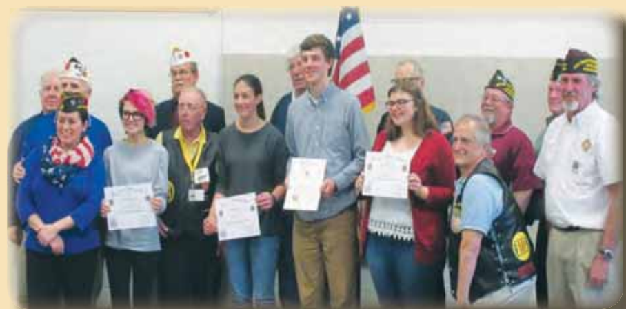
Representatives of Hershey Post 3502 and District 18 present VFW Voice of Democracy certificates to Hershey High School students who participated in the speech writing contest. By appointing a post chairperson and reaching out to local school officials VFW posts of all sizes can participate in this patriotic classroom program.