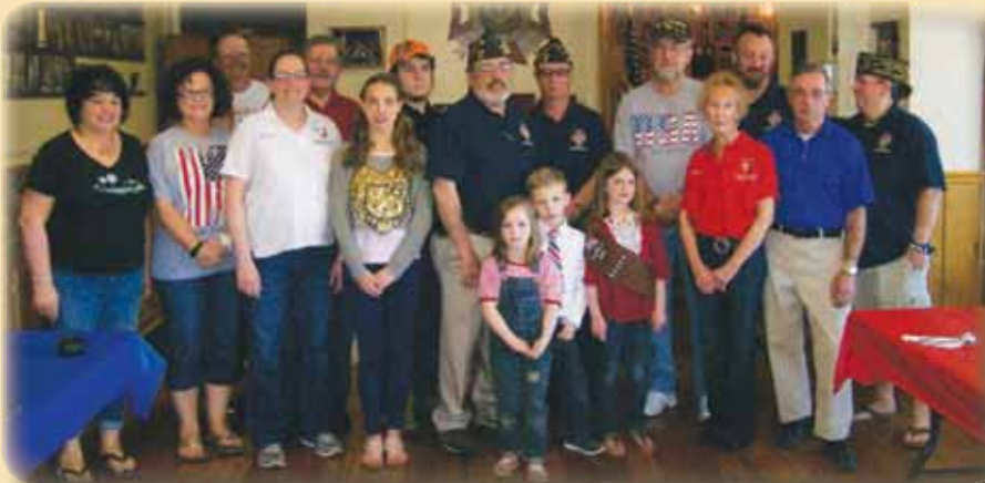
Greensburg Post 33 members, Auxiliary members and local Boy and Girl Scouts welcome hospitalized veterans from the Aspinwall VA facility to the post for a semi-annual spaghetti dinner and bingo party. Each veteran received a gift bag. The guests of honor expressed their gratitude for a delicious meal and entertaining bingo games.