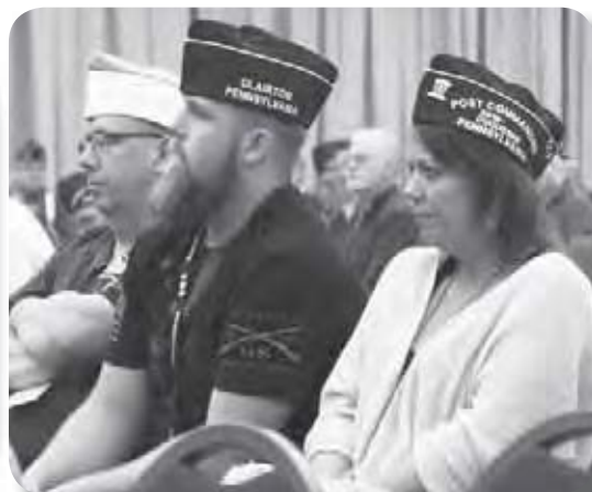
Members from all service eras participated in the Convention including post 9-11-2001 veterans.