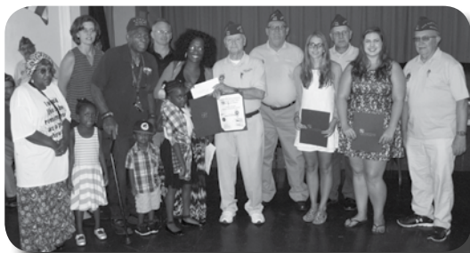
State VFW leadership congratulate recipients of PA VFW Barger Nursing Scholarships, which were handed out during Post Officer Training Institutes.

We may not be able to use mules, dolphins or K-9s to make our posts better, but we can surely apply determination, loyalty, teamwork and new ideas to accomplish our important mission.