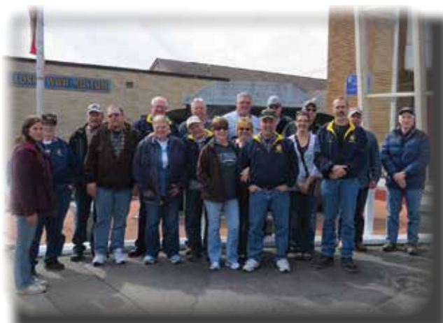
Kane Post 1132 members and guests participated in a bus trip to the Eldred PA World War II Museum. The Post rented a bus and paid admission for 21 attendees. During World War II, Eldred had a bomb factory which was mainly staffed by women. The group also enjoyed visiting three VFW posts during their trip.