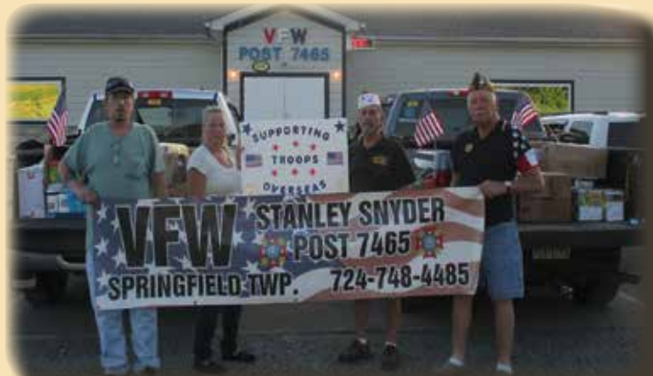
For the second year in a row, Volant VFW Post 7465 won the "Humana Challenge" to all VFW posts in Pennsylvania. The event encourages posts to donate items for deployed troops. Post 7465 collected two truckloads of products that will be appreciated by troops overseas. Thanks to all posts that participated, and congratulations Post 7465!