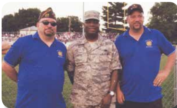
Middletown Post 1620 has experienced strong growth in part because of consistent outreach to military personnel and participation in community service activities.