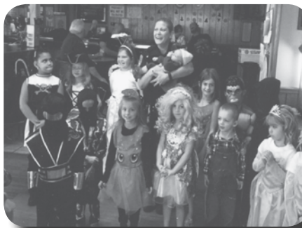
Greensburg Post 33 worked with local law enforcement to conduct a Halloween safety event for area families.