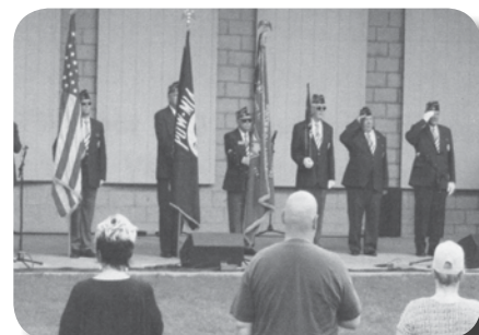
Post 879 participated in Cranberry's Community Days.