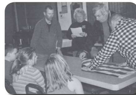
Mechanicsburg Post 6704 teaches youth about the history of our nation's flag.

graves, collect school supplies for less fortunate youth, visit veterans in nursing homes, adopt families during the holiday season and hold benefit events for local families facing financial hardship.