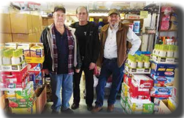
Hamburg Post 216 provided $24,964 of financial support to groups during 2016: Berks Historical Society, VFW National Home, Our Town Foundation, Hamburg Fish and Game, Hamburg Police Department, HAHS Scholarships, Hamburg's Memorial Day Parade, Hamburg Area Music Assoc., Boy and Girl Scout Troops, Union Fire Co., Hawks Baseball Program, St. John's Cemetery Association, Hamburg Jaycee's, the Borough Trick or Treat Night program, Berks Co. Veteran's Hall of Fame, Hamburg Emergency Services, PA Wounded Warriors, Veteran's Making a Difference, Keystone Soldiers Food Bank, donating gift cards to local veterans and holding a Christmas party for veterans.