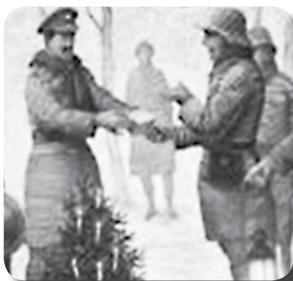
Allied and German soldiers exchange letters during a World War I Christmas truce in 1914.

Silent Night, by renowned military historian Stanley Weintraub, magically restores the 1914 Christmas truce to